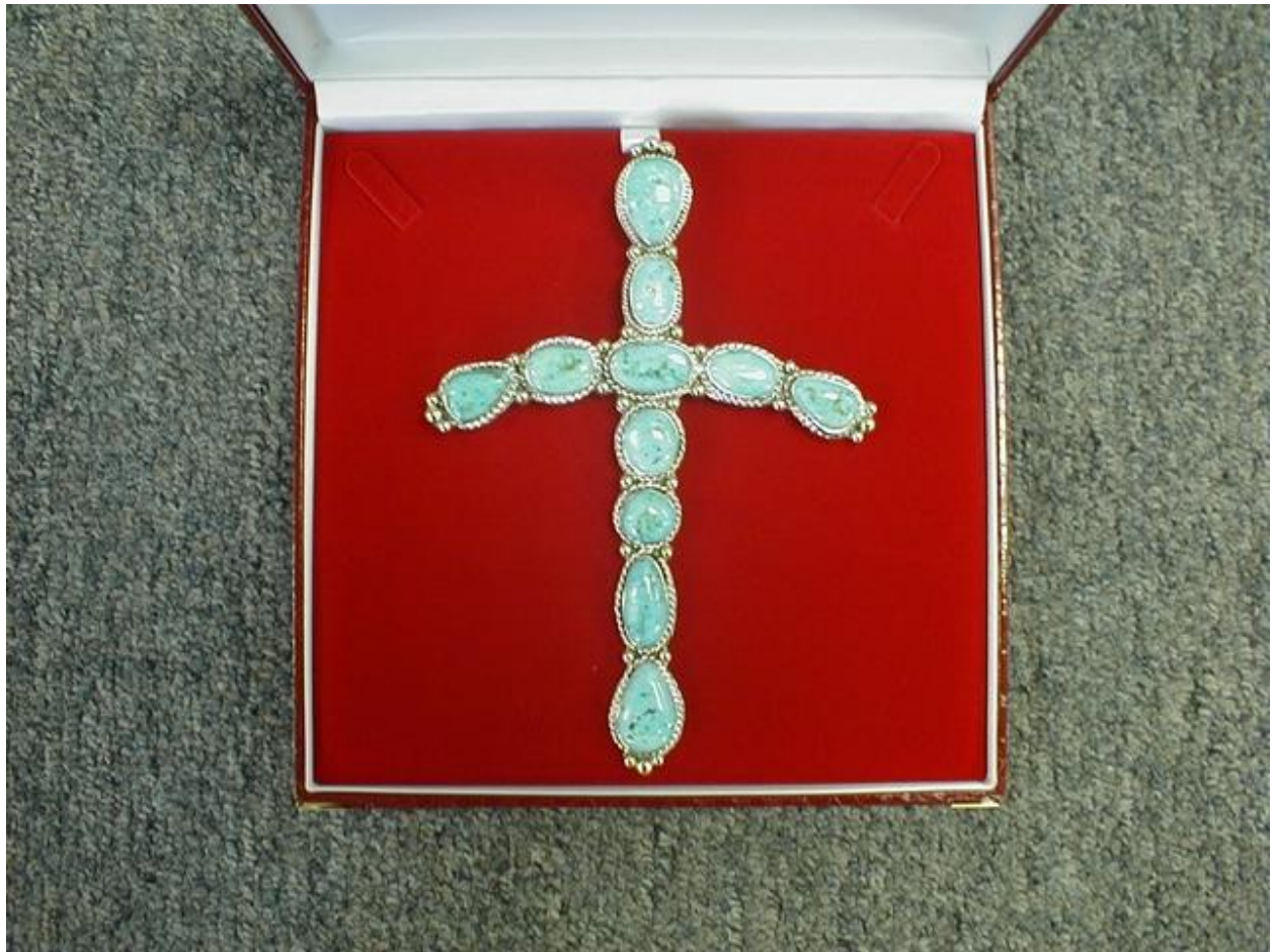
The Pope's Cross