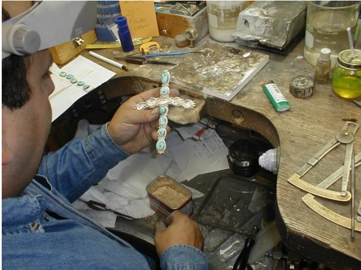
Getting closer, almost done Once again this is the Bishop's cross that is being worked on