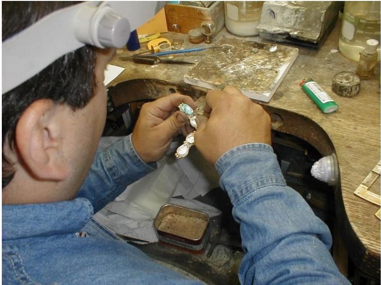
Using a bezel pusher or rocker to set the turquoise