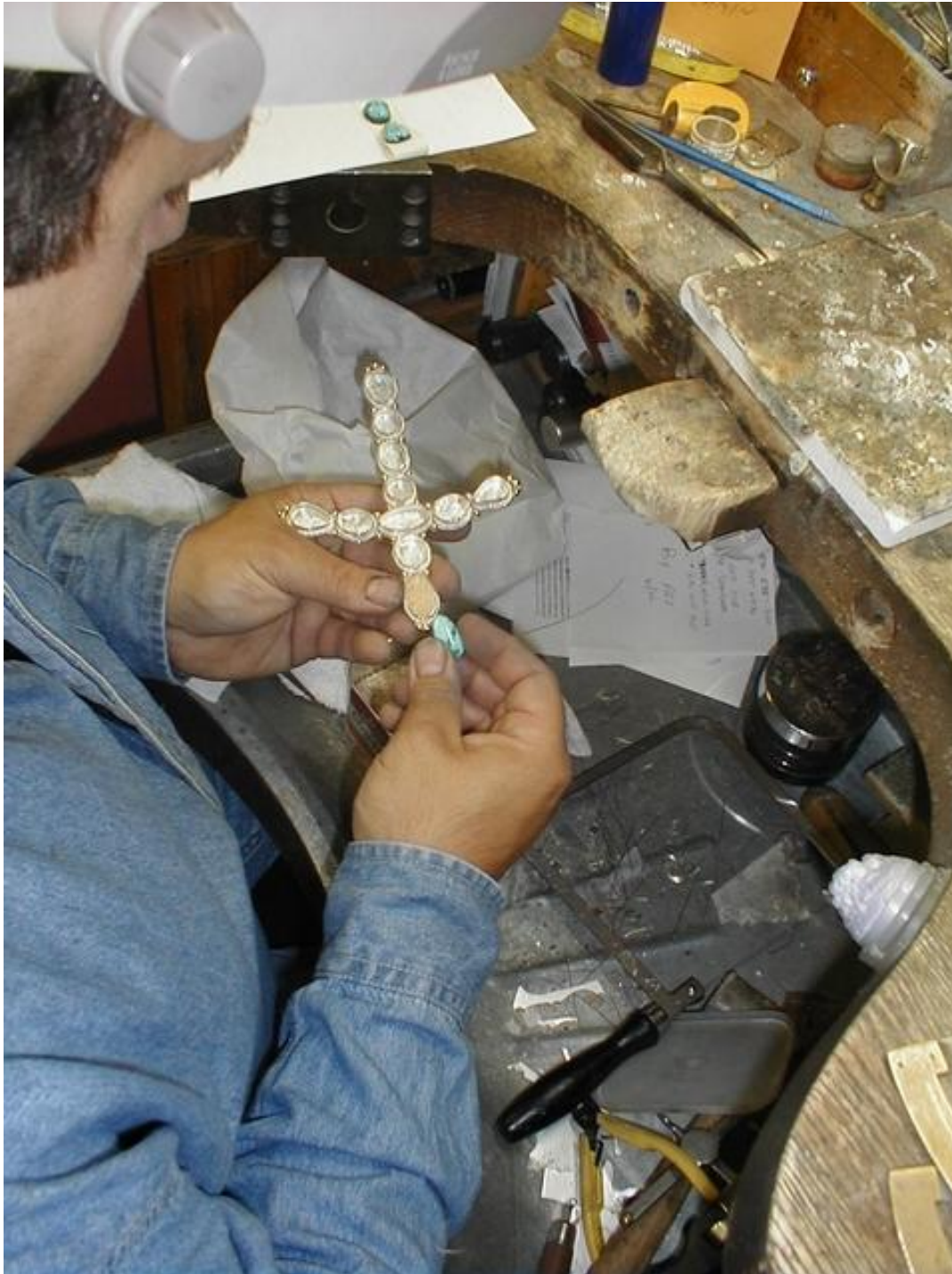
Packing each bezel with sawdust before setting each piece of turquoise into place