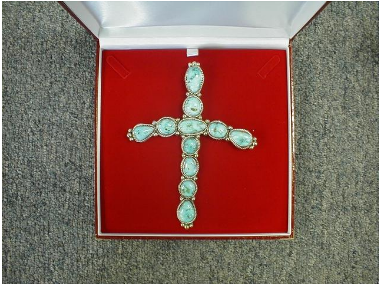
The Bishop's Cross