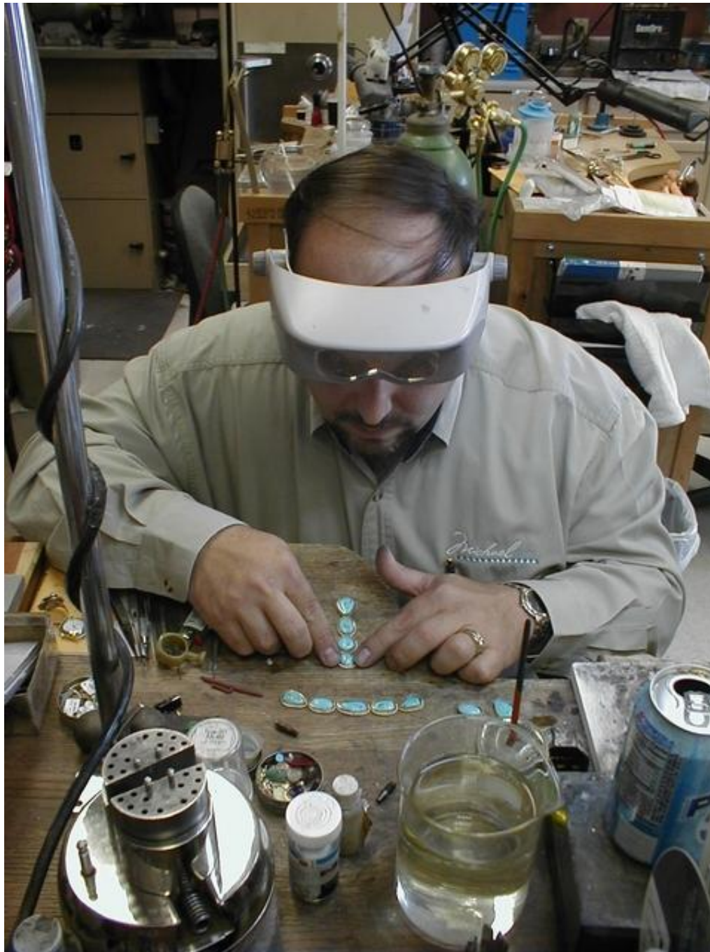
Laying everything out and hand-fitting everything together, piece-by-piece, by piece